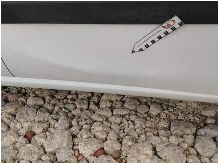
2: Sill ns Dented Between 10mm + 30mm