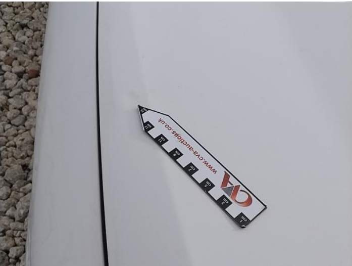
1: Bonnet Dented Over 2 UpTo 10mm